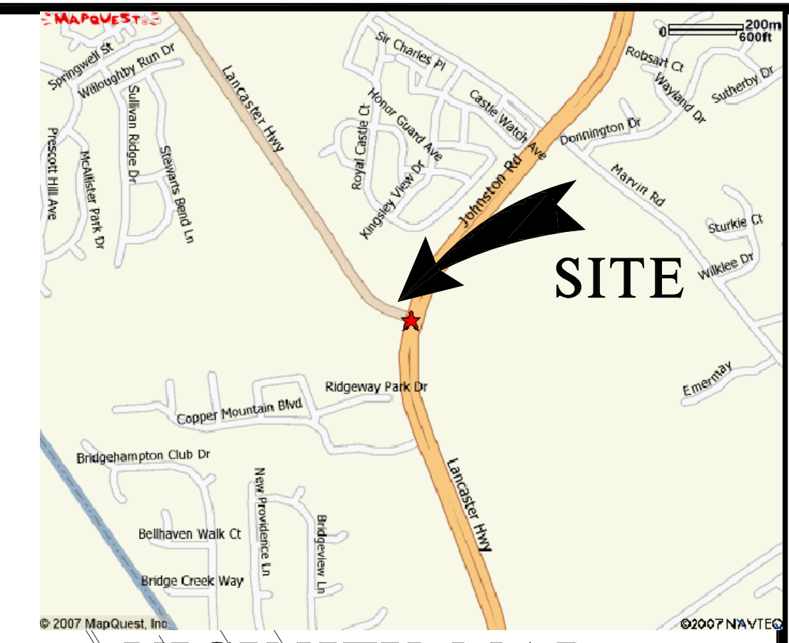
VICINITY MAP SCALE: NTS

AYER DESIGN GROUP PROFESSIONAL ENGINEERING SERVICES 215 Johnston Street Rock Hill, SC 29730 Phone: 803-328-5858