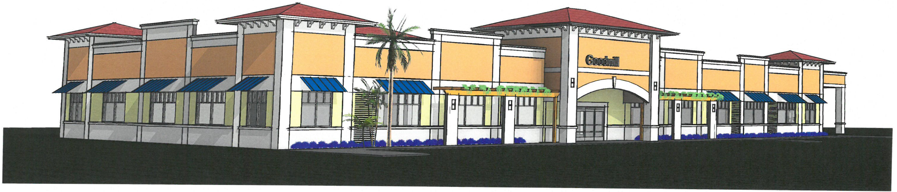
1 PERSPECTIVE 1 SCALE